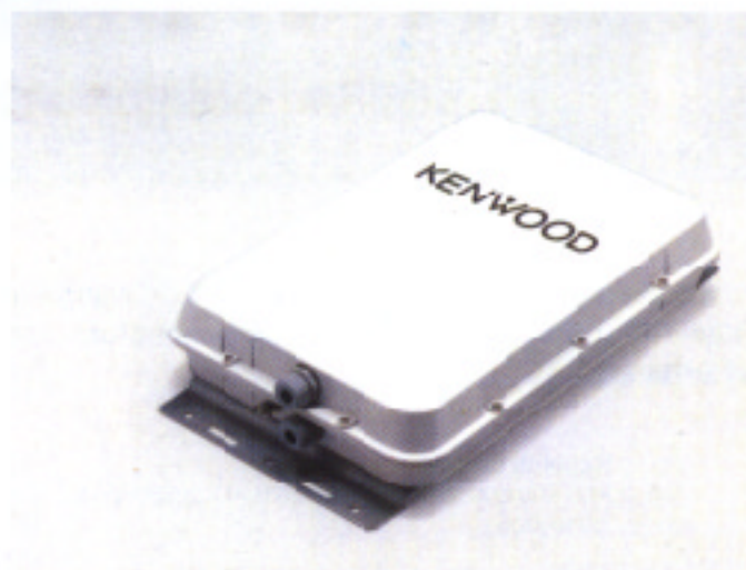
KAT-1: Automatic Antenna Tuner